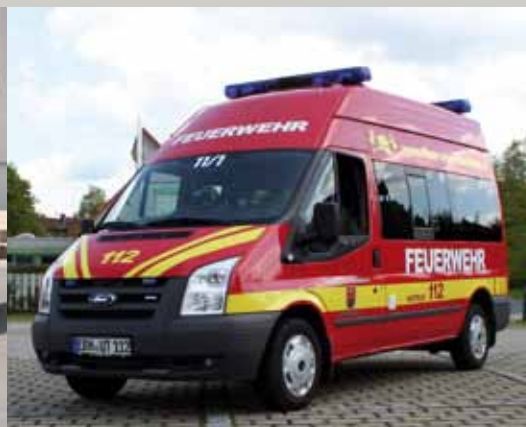
Ford Transit MTW/MZF