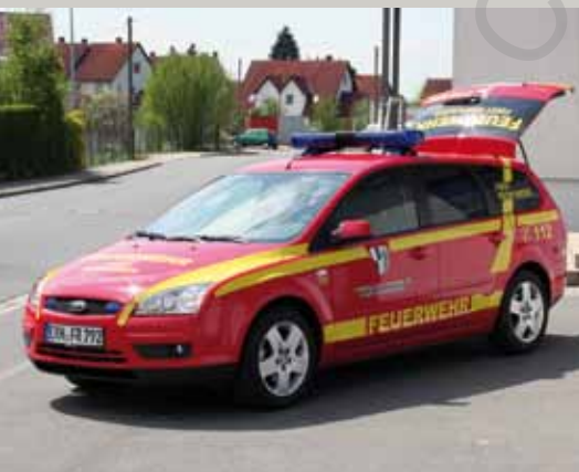
Ford Focus KdoW