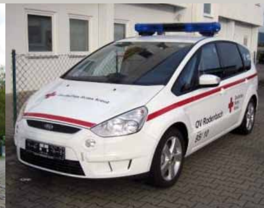
Ford S-Max NEF/KdoW